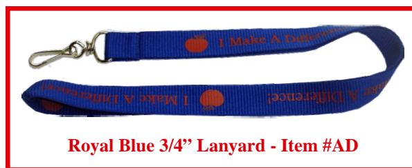
Royal Blue 3/4" Lanyard - Item #AD