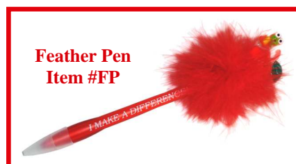
Feather Pen Item #FP