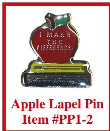
Apple Lapel Pin Item #PP1-2

Minimum Order is 100 Pieces You can mix-and-match in quantities of 50 pieces per item. For example, 50 bookmarks and 50 pens for a total of 100 pieces. All items $.50 each