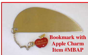
Bookmark with Apple Charm Item #MBAP