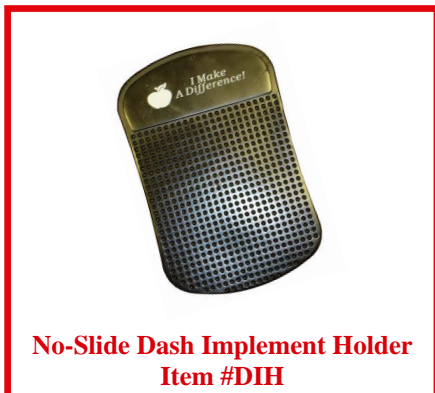
No-Slide Dash Implement Holder Item #DIH