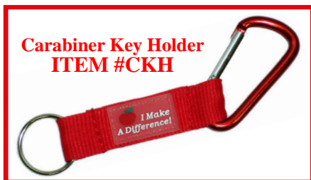
Carabiner Key Holder ITEM #CKH