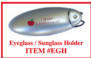
Eyeglass / Sunglass Holder ITEM #EGH