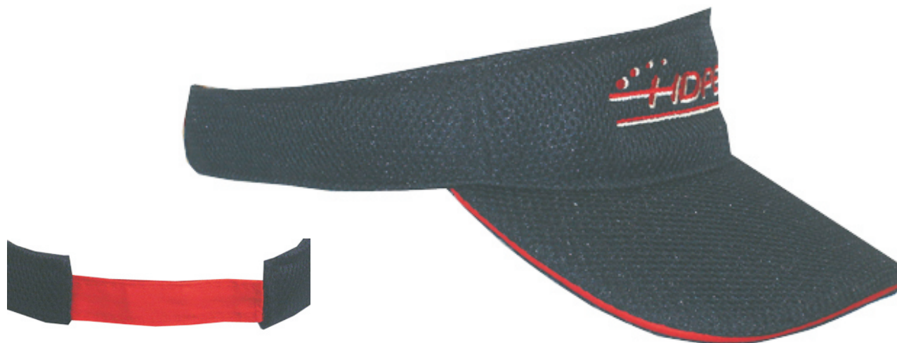
Coordinating Sandwich and Back Velcro Closure