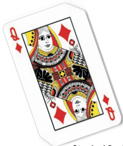
Standard Card Face