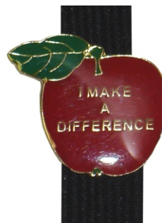
“I Make A Difference” Cloisonne Apple Medallion

Teachers, Administrators, Volunteers, Everyone!